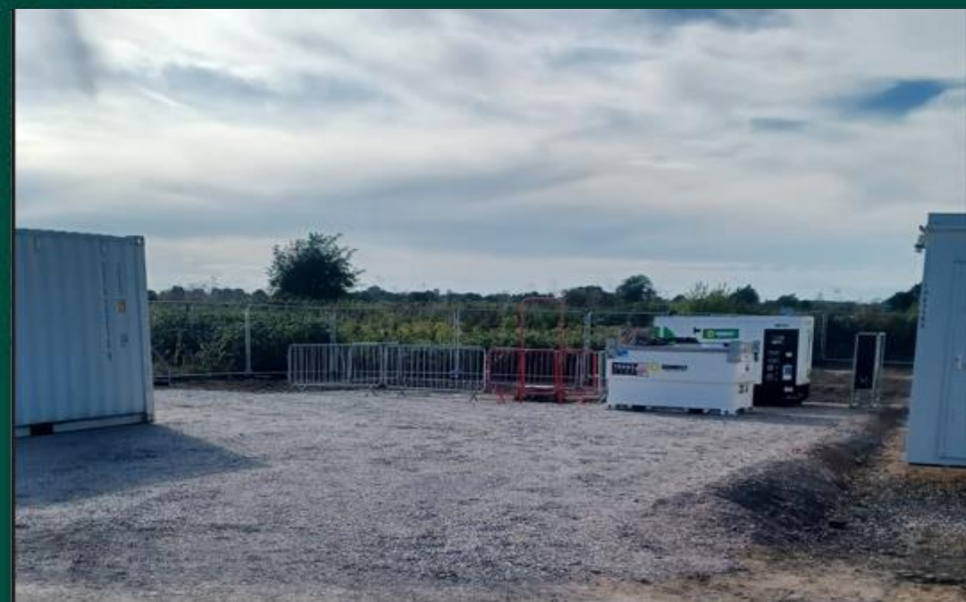
Installation of site cabins during site setup phase