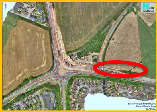
Installation of ducting, kerbing, and drainage along A4095 Southwold Lane