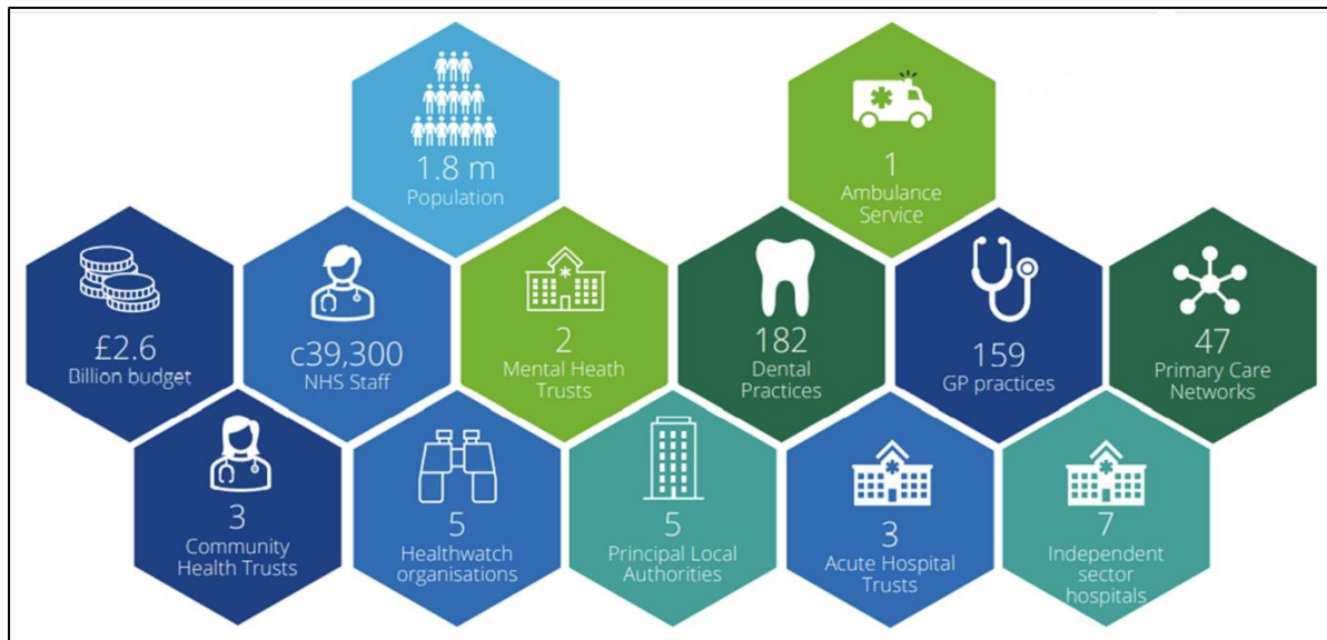
Figure 1: BOB ICS in numbers

Major changes are taking place in the way we organise health and care in Buckinghamshire, Oxfordshire and Berkshire West (BOB) promoting greater cooperation between organisations.