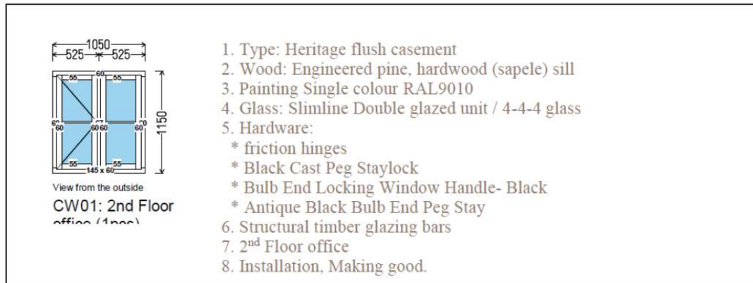
Figure 4: Description of works quoted by Woodcraft Windows: Second floor window

It is intended to replace the windows like for like with wooden windows with slimline double glazing as per the description provided by Woodcraft Windows.