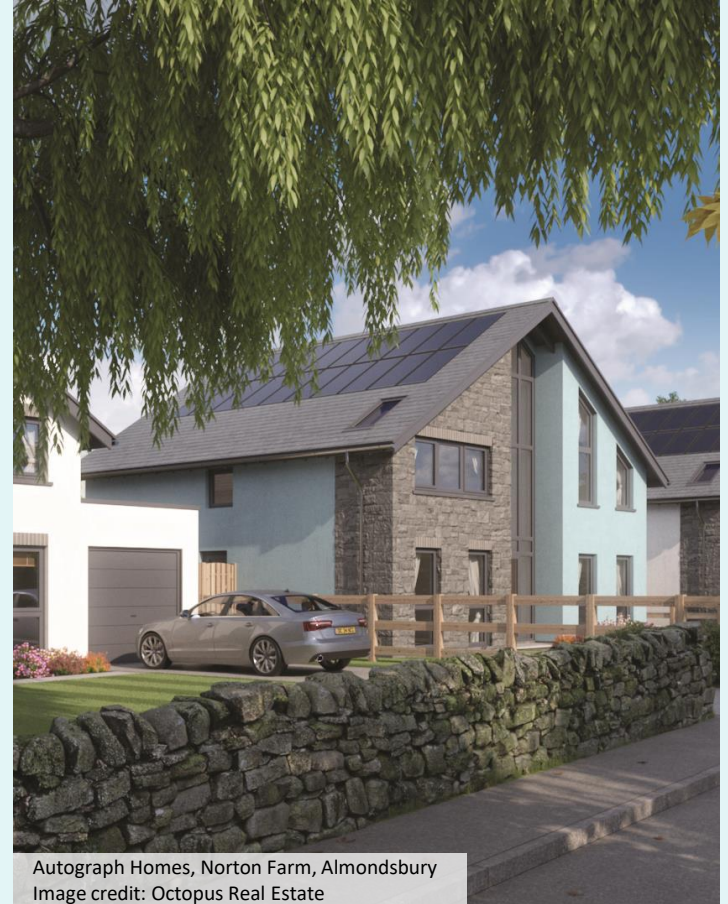
Autograph Homes, Norton Farm, Almondsbury