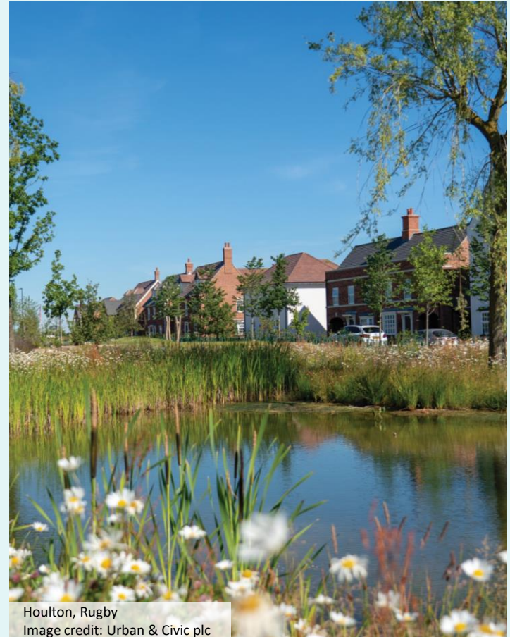
Houlton, Rugby