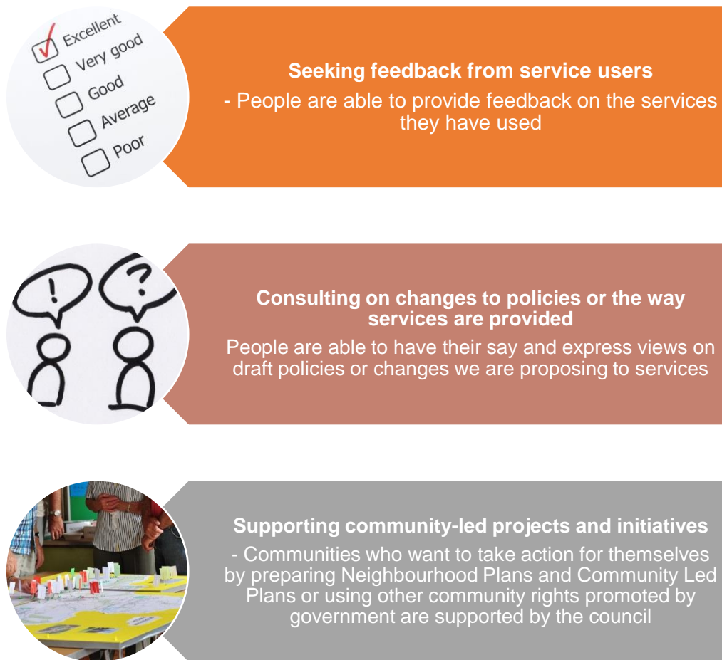
Figure 1: Types of public engagement activity supported by the council 5